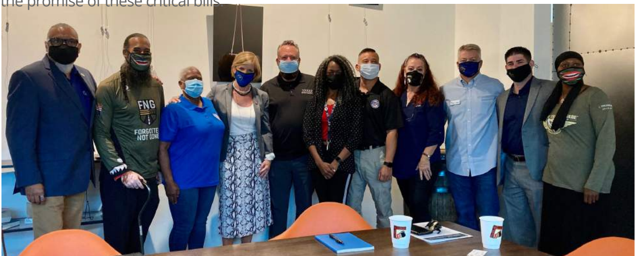
Rep. Lee hosts southern Nevada veterans for a listening session

Throughout these past three months, Rep. Lee has been tirelessly fighting for the bipartisan Infrastructure Investment and Jobs Act and Build Back Better Act and to deliver on the promises that brought her to Congress. As a vocal member of the bipartisan Problem Solvers Caucus, Rep. Lee helped craft the infrastructure bill, which passed the Senate in August. From a letter to leadership , to a bipartisan press conference , and an op-ed with her majority maker colleagues , Rep. Lee is fighting to put the politics aside and deliver on the promise of these critical bills.