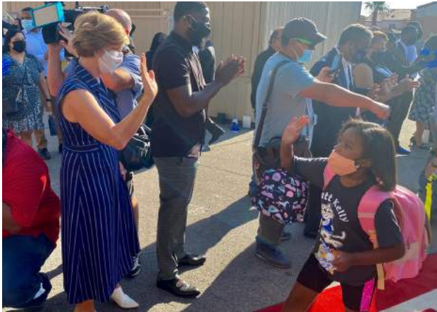
Rep. Lee high-fives students for Nevada Youth Network's red carpet first day of school celebration